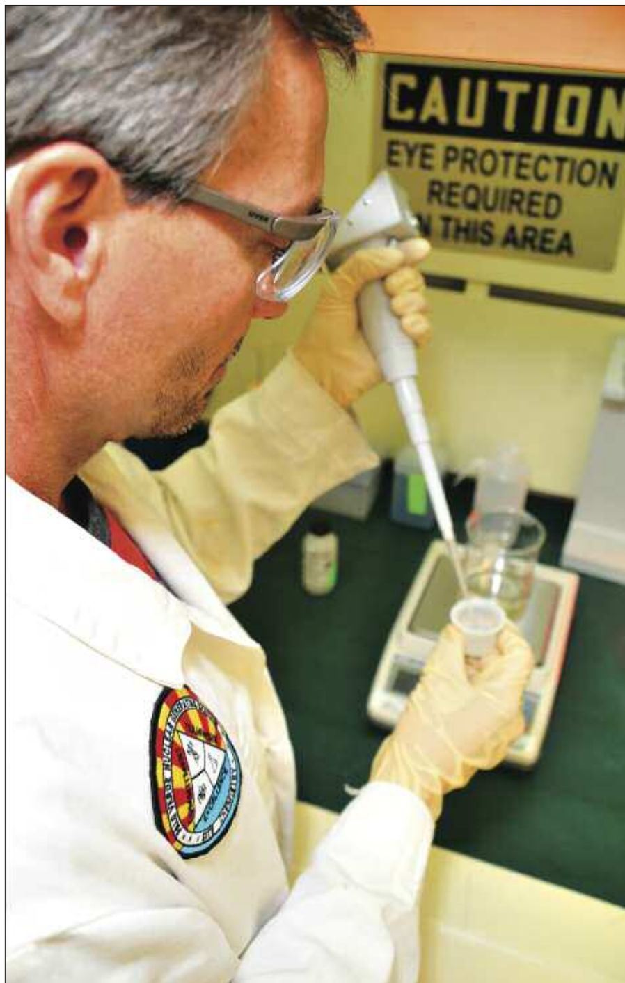
A chemistry technician verifies system purity specifications.

The achievement of the lowest-ever personnel radiation exposure level at Palo Verde-1 and in the industry was the culmination of years of hard work, continuous improvement, and the implementation of innovative ideas, processes, and technologies. It was based on a conscious effort to achieve national leadership in safety performance, largely by reducing personnel exposure. The ALARA success has been a true team effort, with major contributions across all disciplines and departments. Lessons learned will continue to be used to improve outage results. The Palo Verde Radiation Protection team hopes to see this record broken soon—by other stations, as well as by another Palo Verde unit. ■