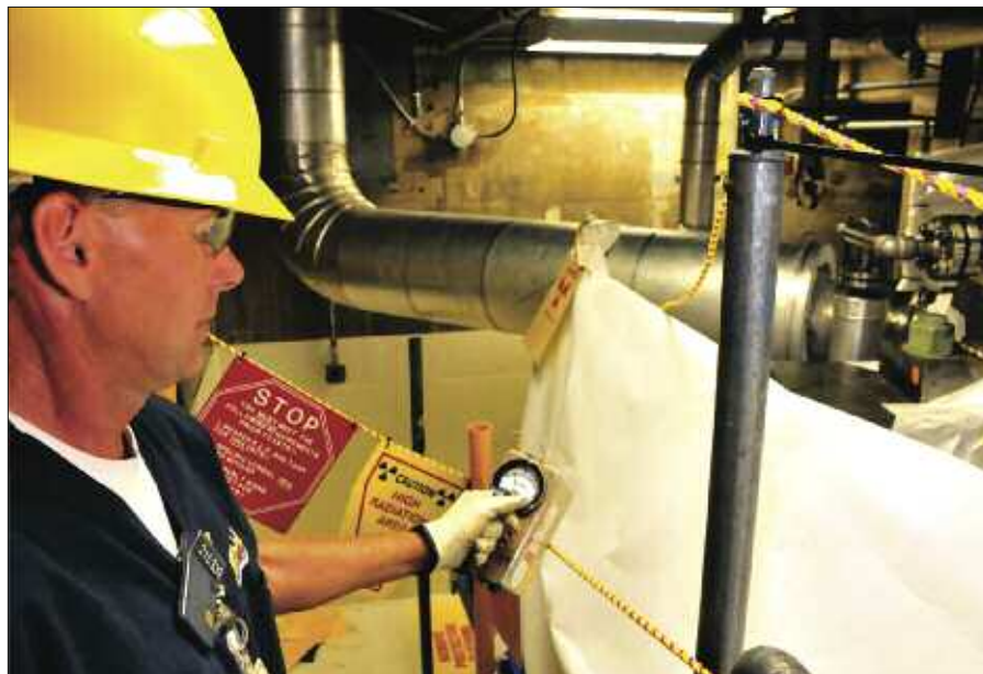
A radiation protection advisor takes a reading to ensure that a high radiation-area boundary meets regulatory requirements.

At Palo Verde, financial incentives are associated with achieving outage goals, and, in turn, a major component of outage goals is keeping radiation exposure within