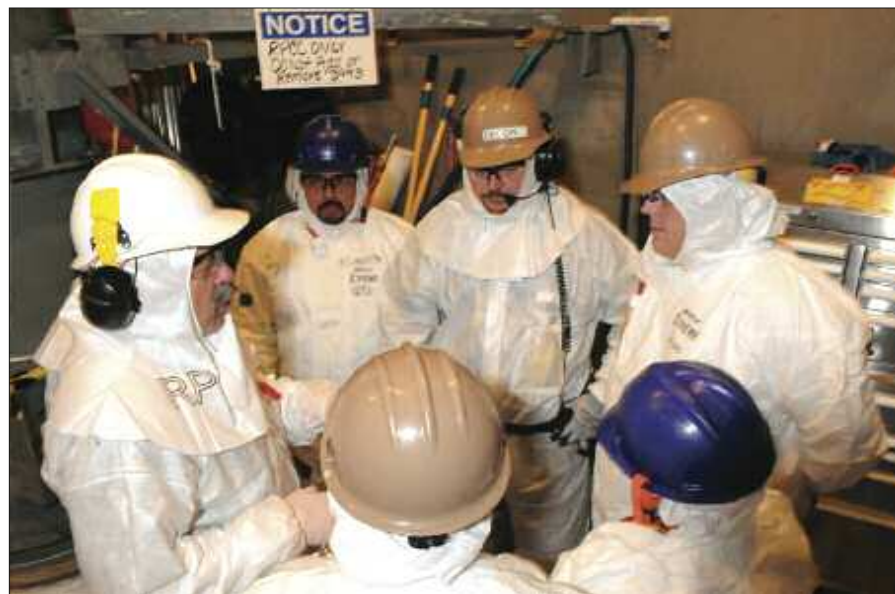
Radiation Protection conducts a two-minute drill to ensure that workers understand conditions prior to entering the work area.

Improved outage processes, planning, equipment, and tools all contributed to Palo Verde's lowest-ever personnel radiation dose achievement.