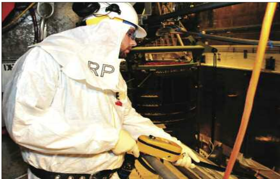
A survey with an extended teletector probe helps keep a radiation protection technician's dose as low as reasonably achievable.

engineering disciplines, Station Chemistry, Radiation Protection, Operations, and Maintenance. The group reviews operating limits and recommends changes if the fuel would be adversely affected. The team addresses all aspects of designing, fabricating, and transporting fuel, and of loading it into and unloading it from the reactor core; how the fuel is unloaded and reloaded several other times during the life of each fuel as-