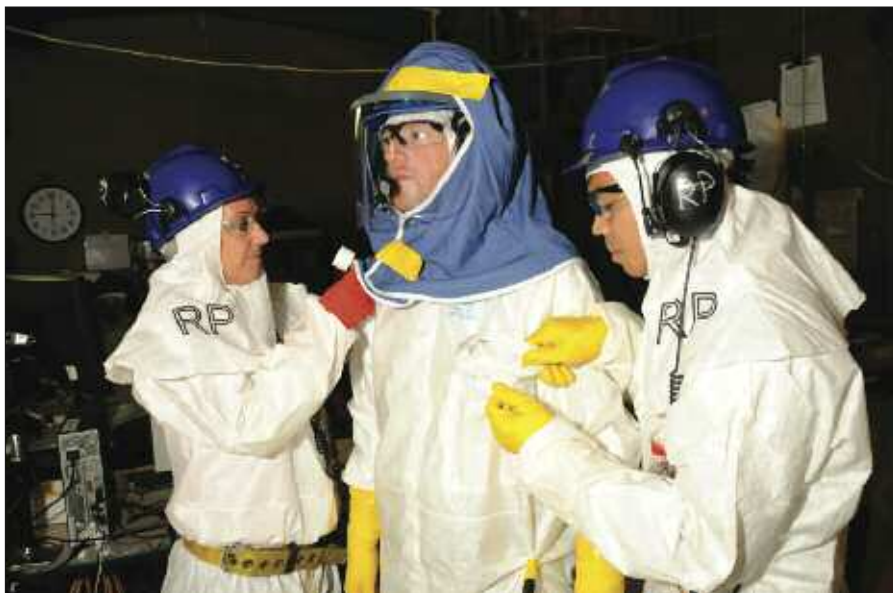
Members of the Radiation Protection team assist a worker in donning advanced protective clothing.

planned limits. Executive management demonstrates its seriousness about dose reduction by making these incentives available not just to APS employees but to supplemental employees as well.