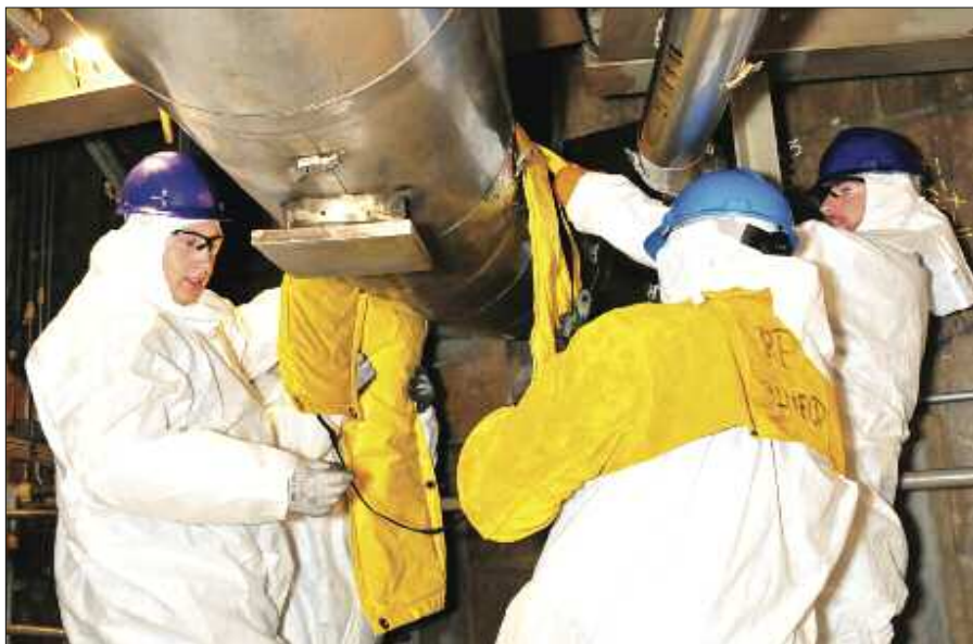
Workers install temporary shielding to lower radiation levels in the work area.

no primary-side steam generator inspection and maintenance activities were performed, allowing for a 7- to 10-rem exposure reduction.