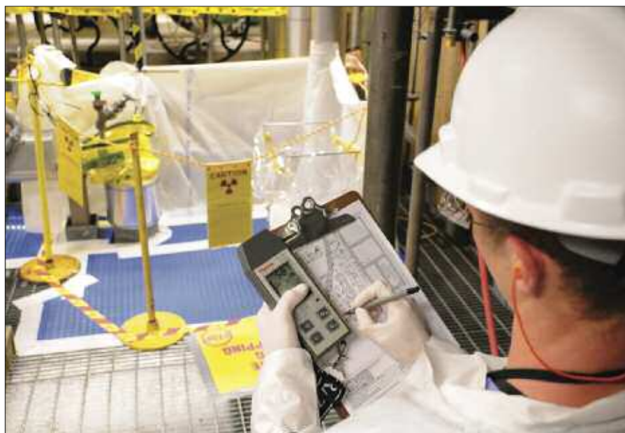
A radiation protection technician performs a routine radiation survey of work areas.