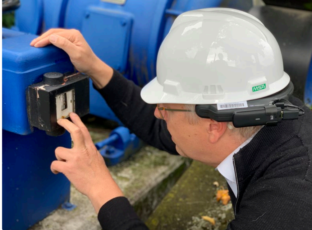
An on-site inspector performs a visual inspection of an oil pressure adjustment on an emergency power generator.

The nuclear industry is highly regulated, both in terms of occupational safety and environmental protection. Therefore, only specially qualified nuclear equipment may be used for safety-relevant components. The safety assessment of a newly built power plant or newly installed plant components usually involves travel to the factories involved in the production process. These locations are spread all over the world—both a cost and a time factor—while the number of nuclear safety experts is limited.