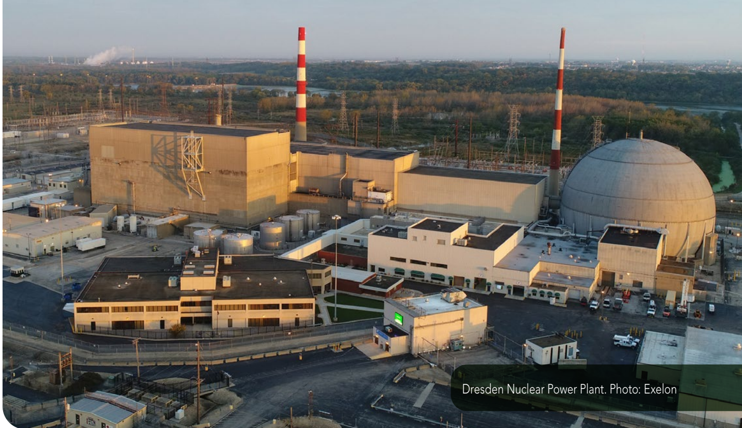
Dresden Nuclear Power Plant.