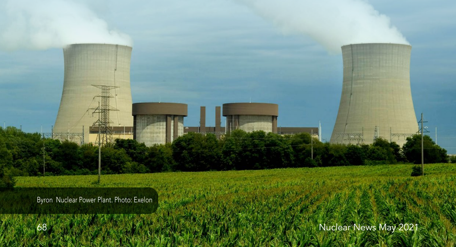
Byron Nuclear Power Plant.

“That’s what renewables get,” says Emmett. “They get renewable energy credits, solar credits, offshore wind credits—a compensation mechanism for the clean aspects of those projects. Nuclear doesn’t, except for the handful of programs where the states have acted. With the extension of the zero-emission credit program to Quad Cities and Clinton in 2016, Illinois acknowledged that those clean resources were challenged. They were in the same situation that we are now in with Byron and Dresden.”