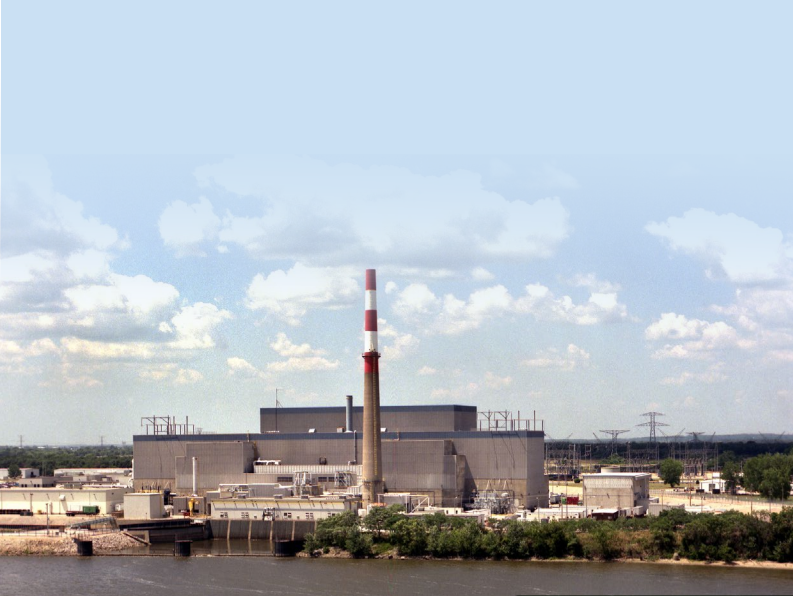
Quad Cities Nuclear Power Plant.