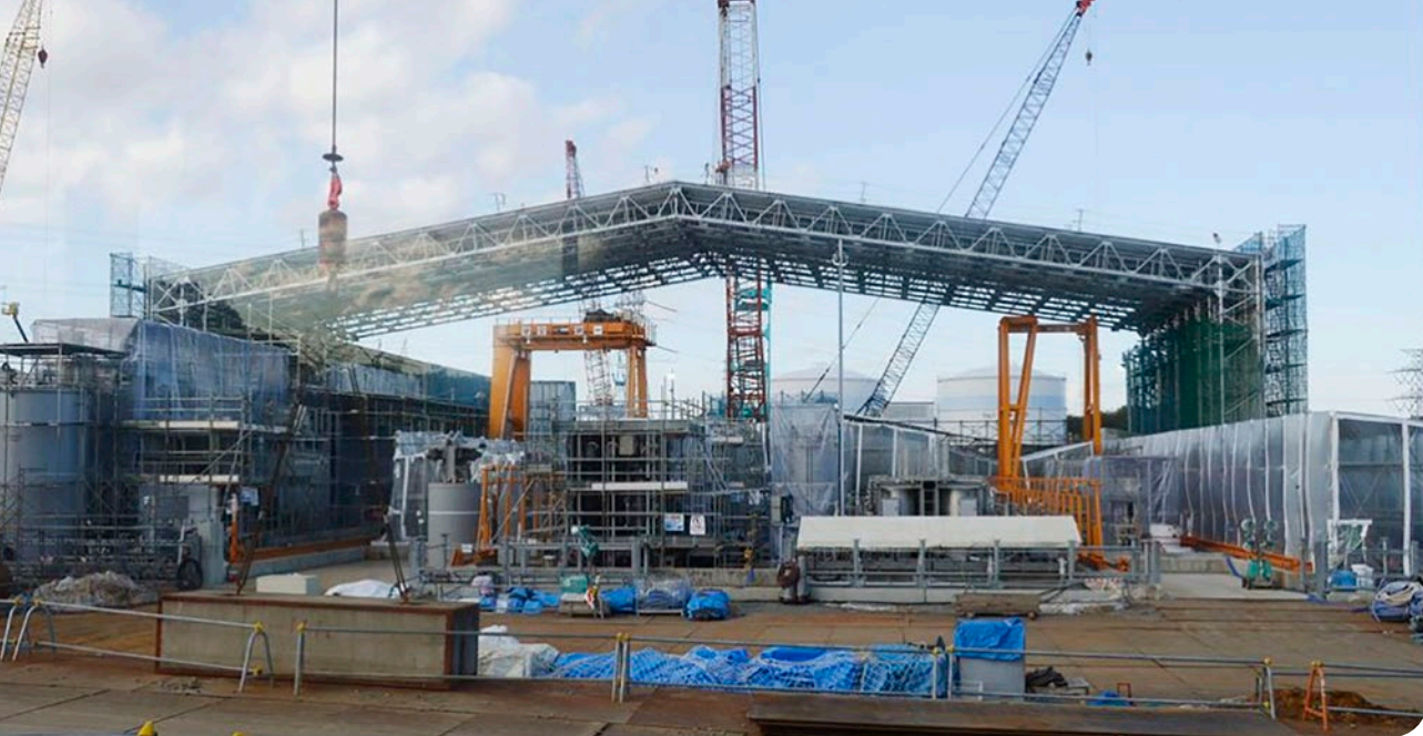
Construction of the ALPS processing facility on the Fukushima Daiichi site in 2013.