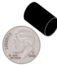
Uranium Fuel Pellet (actual size)