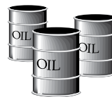
3 Barrels of Oil (42 gal. each)