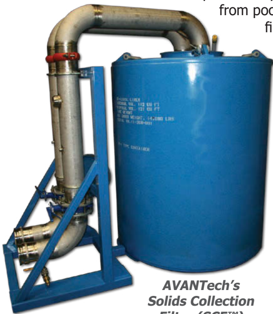
AVANTech's Solids Collection Filter (SCF™)

Traditional in-plant filtration systems are not meant to handle the transient load of suspended solids present during outages and other special maintenance operations. Many operators come to rely upon nuclearized "pool vac" type filtration units to maintain water clarity, but these units suffer from poor contaminant removal efficiency, short filter run-times between filter element replacement, or both. Observing an industry need for improved filtration, AVANTech engineers began researching and testing differing filter mediums in a variety of configurations; the result of their efforts is AVANTech's Solids Collection Filter™ (SCF™) that has now been deployed and relied upon by a multitude of commercial nuclear utilities and governmental nuclear facilities for maintaining water purity in fuel pools, reactor cavities, emergency cooling systems (torus, suppression pools, and refueling water storage tanks), and for a variety of other online and outage related filtration and waste packaging activities.