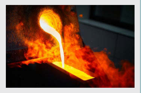
Radioactive Metal Treatment Application for Melting Facilities

In Drum Pyrolysis Thermal Waste Treatment