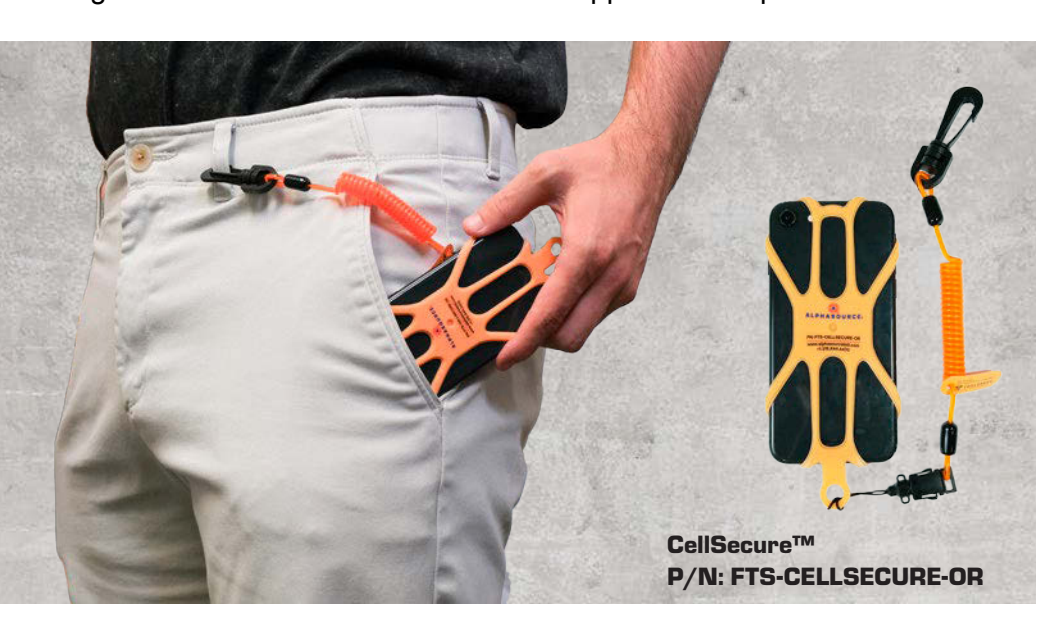
Introducing our brand new drop prevention product; the CellSecure™. This flexible rubber attachment can wrap around any smartphone, quickly securing it to your person without interfering with its usability.

Alphasource is widely recognized in the industry for our commitment to high-quality products, exceptional customer service, and competitive pricing. Our team is comprised of former leaders in the Power Industry, not just salespeople. Drawing from our experience as former end-users of FME and Drop Prevention products, we offer a unique perspective to our customers, ensuring we deliver products and services tailored to their organizational and cultural needs. This approach has proven successful with our global clientele.