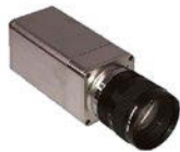
MegaRAD10 produce color or monochrome video up to 1 \times 10^7 rads total dose