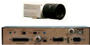
MegaRAD3 produce color or monochrome video up to 3 \times 10^6 rads total dose

With superior capabilities for operating in radiation environments, the MegaRAD cameras provide excellent image quality well beyond dose limitations of conventional cameras, and are well suited for radiation hardened imaging applications