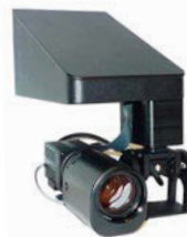
KiloRAD PTZ radiation resistant camera with Pan/Tilt/Zoom